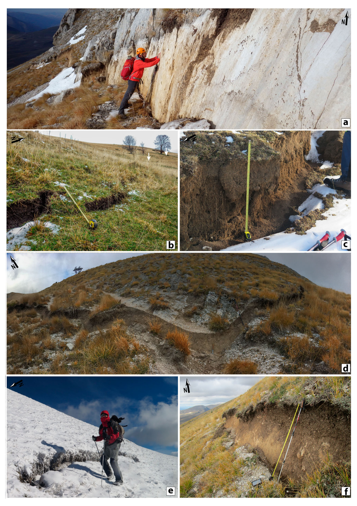
Figure 3. Examples of coseismic ruptures along the Mt. Vettore–Mt. Bove fault system as seen in the field. (a) Bedrock fault plane with freshly exposed free-face at Mt. Redentore (42.8189 N, 13.2522 E); note that the upper part of the free-face was exposed during the 24 August earthquake (10-20 cm); (b) right-stepping ruptures affecting colluvium, white arrows mark the trace of the ruptures in the distance (42.8488 N, 13.2213 E); (c) close view of decimetric throw affecting soil (42.8820 N, 13.2267 E); (d) metre-scale coseismic scarp cutting a small gully (42.9139 N, 13.1917 E); (e) frozen coseismic rupture (42.8751 N, 13.2290 E); (f) coseismic exhumation of buried bedrock fault plane covered by thin soil (42.8138 N, 13.2460 E).

345° striking, NE-dipping) strands. Notably, the alignment of ground ruptures typically follows the trace of mapped faults (Pierantoni, Deiana, & Galdenzi, 2013